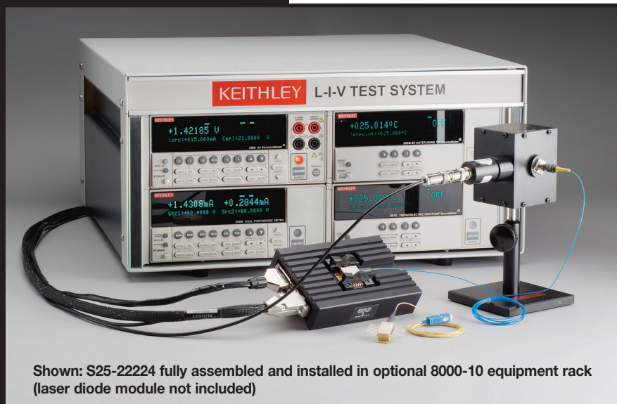
Shown: S25-22224 fully assembled and installed in optional 8000-10 equipment rack (laser diode module not included)